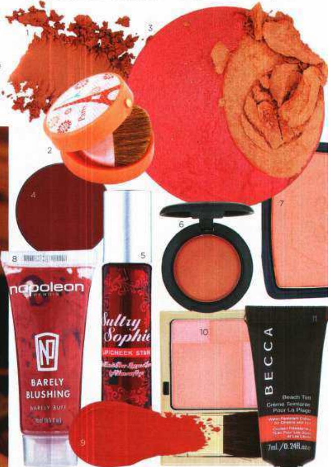
1. B Collection by Bloom Pure Mineral Blush in Barrier Reef, $35. 2. Bourjois Paris Fete Paris Blush in Ambre d'or, $20. 3. The Body Shop Baked to Last Blush in Coral, $33.95. 4. Ere Perez Natural Carrot Cheek & Lip Balm in Happy, $27.95. 5. Glamourflage Sultry Sophie Lip/Cheek Stain, $19.95. 6. MAC Cream Colour Base in Improper Copper, $35. 7. Rimmel Powder Blush in Santa Rose, $9.95. 8. Napoleon Perdis Barely Blushing in Barely Buff, $30. 1800 814 572. 9. Stila One Step PrimeColour in Capri Coral, $48. 10. Clarins Blush/Prodige in Lovely Rose, $60. 11. Becca Beach Tint in Grapefruit, $44.