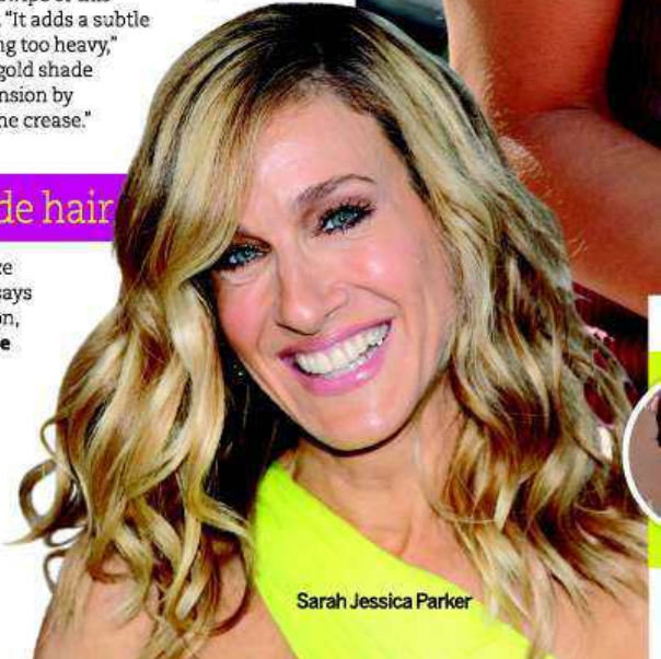
Sarah Jessica Parker