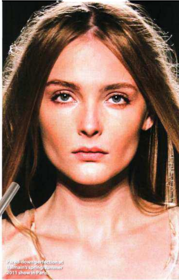
Paris-down perfection at Balmain's spring/summer 2011 show in Paris