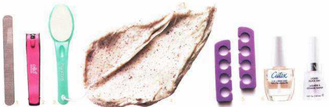
TEXT BY LUCY ADAMS