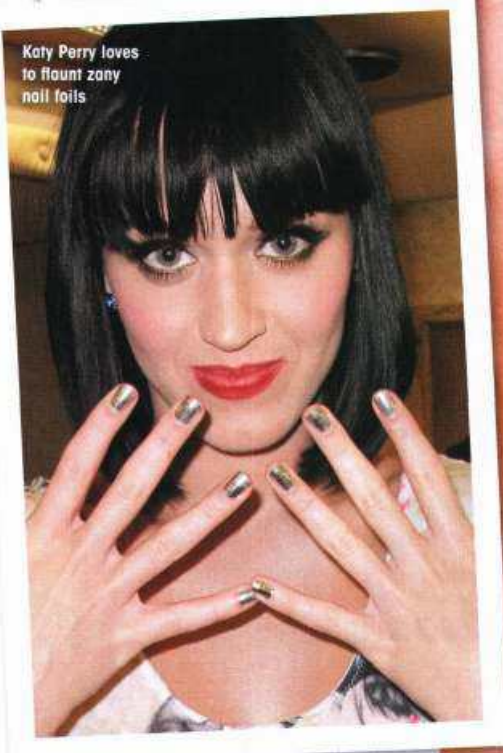
Katy Perry loves to flaunt zany nail foils